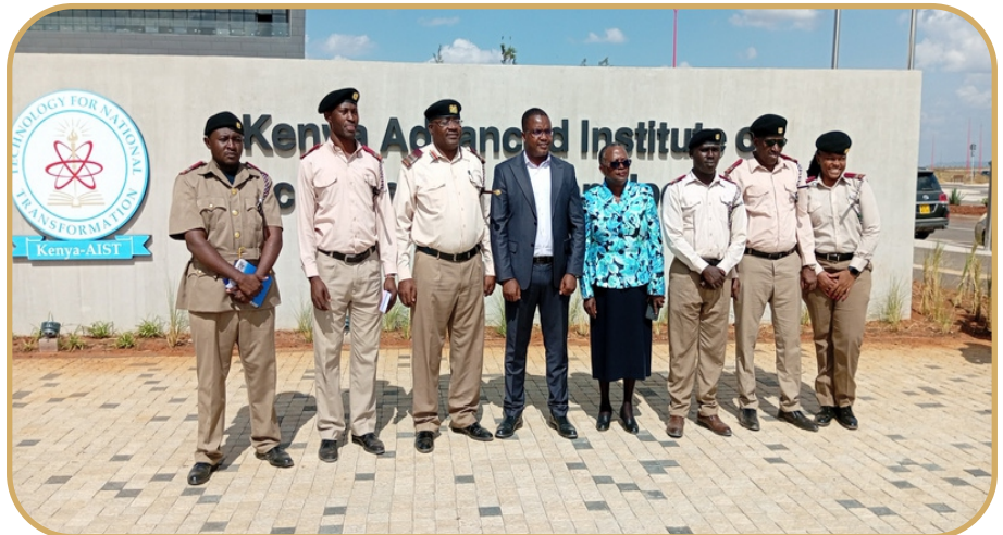
A section of NGAO Leadership pose for a photo at the Kenya-AIST Campus with the Kenya-AIST Chairman and the Ag. Principal