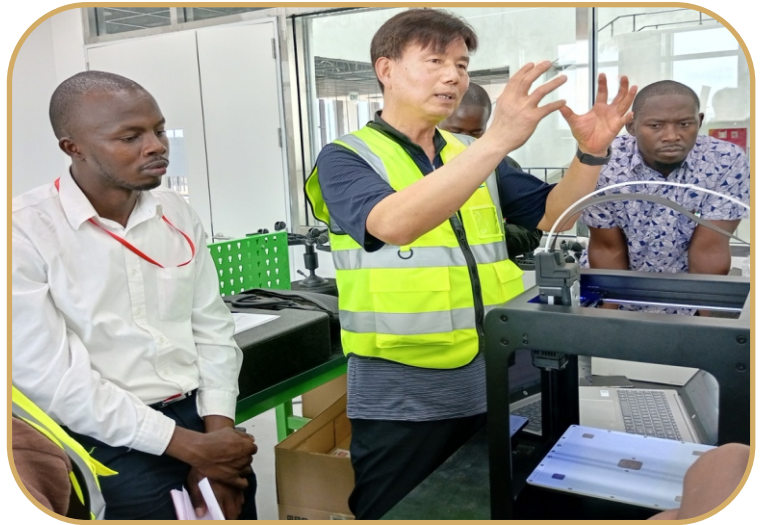
Training on 3D Printer at the Robotics Lab

Staff members also participated in the development and customization of various systems including the Enterprise Resource Planning (ERP) System which will be key in streamlining administrative functions such as admissions, HR, procurement, and finance among others. The staff also received training on the Digital Library System which has been customized to ensure Kenya-AIST's library is a digital hub, granting access to global academic resources.