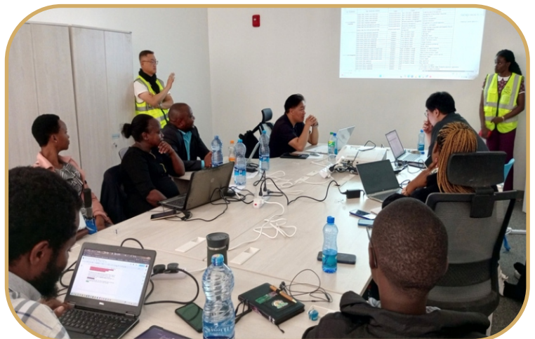
Customizing the ERP System