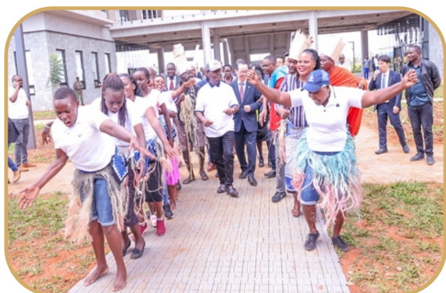
Traditional dancers welcome the Cabinet Secretary, MICDE in dance and splendor.