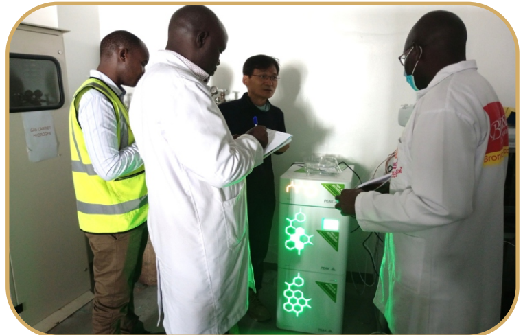
Training on Gas Chromatography at the Basic Sciences Lab