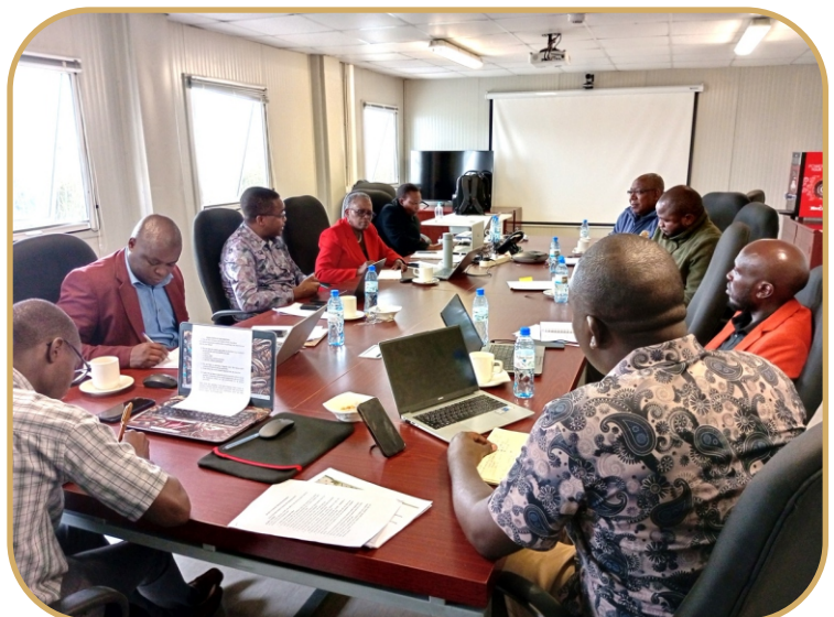
Multi-sector security meeting proceedings

The discussions reinforced Kenya-AIST's commitment to building a safe and secure environment for students, staff, and visitors.