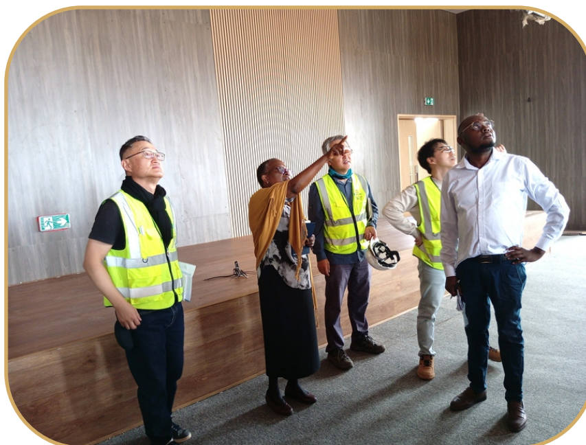
Inspection of Auditorium

In preparation for the takeover, Kenya-AIST staff toured the facilities on the first week of April. These final refinements marked a critical step toward ensuring Kenya-AIST's full operational readiness. Led by the Ag. Principal, the staff appraised key infrastructure installations. The team also undertook a thorough walkthrough of the campus core and academic buildings with the hope of moving in soon.