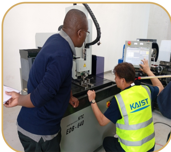
Training on the EDM Machine at the Workshop